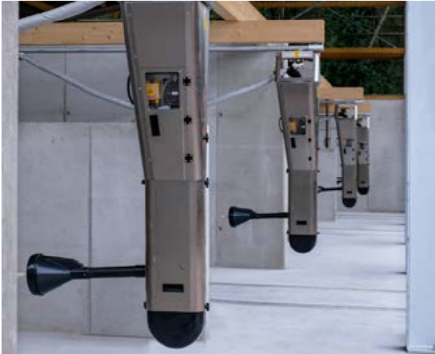
Installation of 4 CalfRail units at the Milchgut Bahnitz GmbH

„Since we regard healthy, vital calves as an essential basis for an efficient milk production, in the last few years we have invested extensively in prenatal and postnatal care as well as the early rearing phase. The introduction of automated feeding for 80 rearing calves led to the stabilization of health and better growth in this crucial stage of development. This investment was realized in 2018 and effected not only a significant improvement of the living conditions of the calves, but also of the working conditions of our employees.“