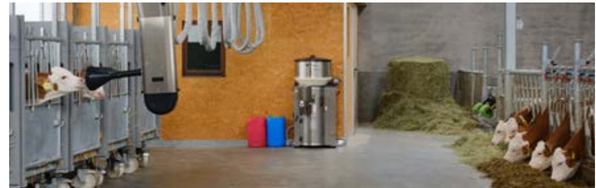
Supplying feed to CalfRail and groups using only one automatic feeder