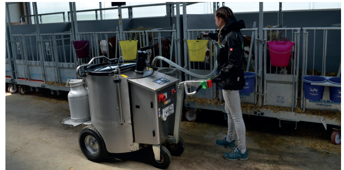
The desired feed amount is dosed precisely at the push of a button.