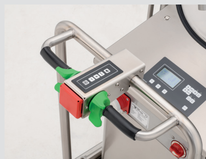
Drawbar head (pushing version)

The drawbar head - no matter if pulling or pushing - has all the important functional keys for the operation of the dosing unit, adjustment and selection of the feeding amount and the change of the driving level.