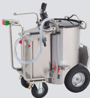
120 liters, push

The MilchMobil NEXT impresses with many new functions and equipment options that are essential in the daily farm life. It is available as 120 and 200 liters model with and without cooling floor and as 300 liters model without cooling floor. Depending on the type, the MilchMobil NEXT can be pushed or pulled.