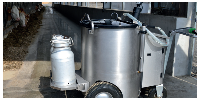
The optional foldable holder simplifies the transport of multiple milk jugs or buckets.