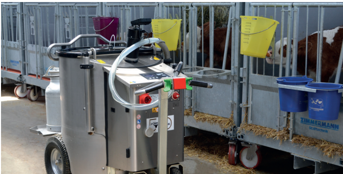
The ideal solution for feeding calves in individual boxes.

2-stage agitator, 8,0 kW water bath heating, circulation cleaning, portion control, 2-stage electric drive and MR-calculator.