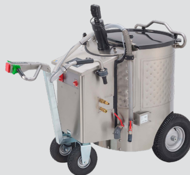
200 liters, push & pull