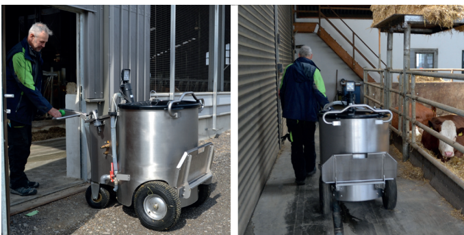
The four wheels and the electric drive ensure optimum driving stability - no matter where.