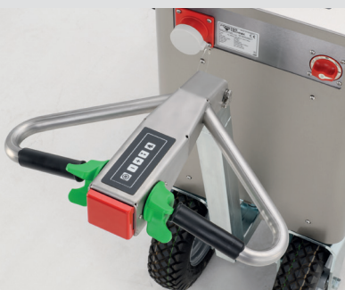
Drawbar head (pulling version)

A shorter wheelbase and the round design enable an easier, safer, more agile driving in all conditions. Additionally, the MilchMobil NEXT is available as pulling model (200 & 300 liters) and as pushing model (120 & 200 liters). Thus, an ideal solution to any requirement is created.