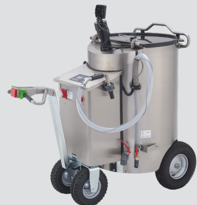
300 liters, pull