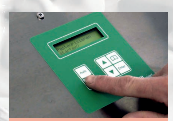
Completely automated pasteurisation

The milk is heated in the coiled tube heat exchanger and held exactly at the pasteurisation temperature so it cannot overheat. The natural milk taste is retained.