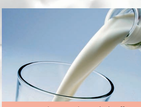
Hygienic and pure with very little effort

A process controller runs through the pasteurisation process completely automatically when the start button is pressed. From warming up, heating, keeping hot and cooling to rinsing with water.